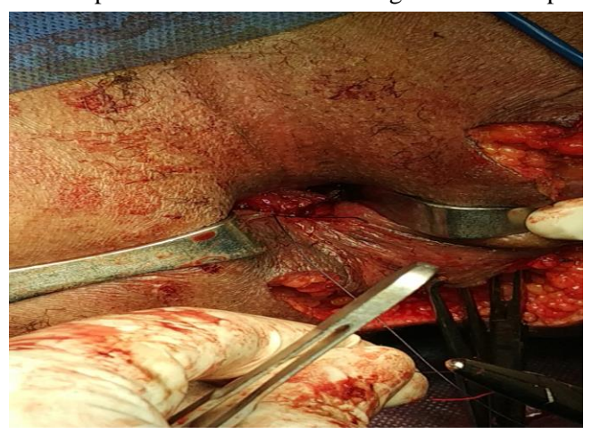
Figure (12): closure of rectal advancement flap by absorbable sutures.