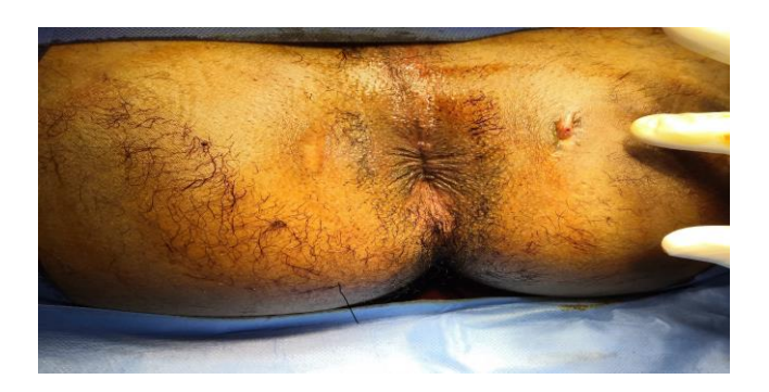
Figure (1): Case of high transphicteric fistula with external opening at 2 o'clock and internal opening at 6 o'clock