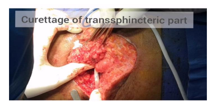
Figure (9): curettage of trans sphincteric fistula tract by gauze