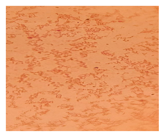
Fig. 2: A gram negative bacilli D.acidovarans.

B. Down part of the plate: non-lactose fermenting colonies of D.acidovarans on MacConky agar